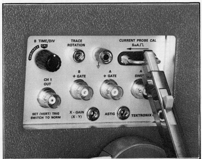
Fig. 2-2 Current flow in a conductor.