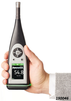
Fig. 2 The sound level meter's lightweight design and user-friendly display

B&K 2245 provides effortless usability with a dust- and water-resistant body that is rubberized for a more secure grip and ensured compliance to IP 55. The seven control buttons can be comfortably operated with one hand, and the clear, bright display shows you the most important information at a single glance. With a 13-hour battery life, you can be sure it will not let you down.